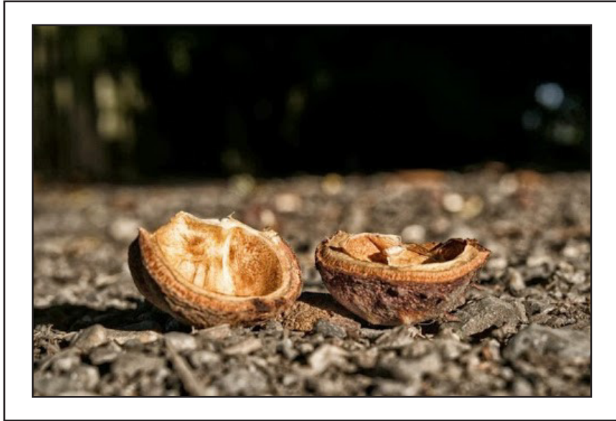
CLOSE-UP PHOTOGRAPH OF MUSTARD SEED, BROKEN OPEN

CELEBRATING THE BEAUTY & TRADITION OF SACRED ART