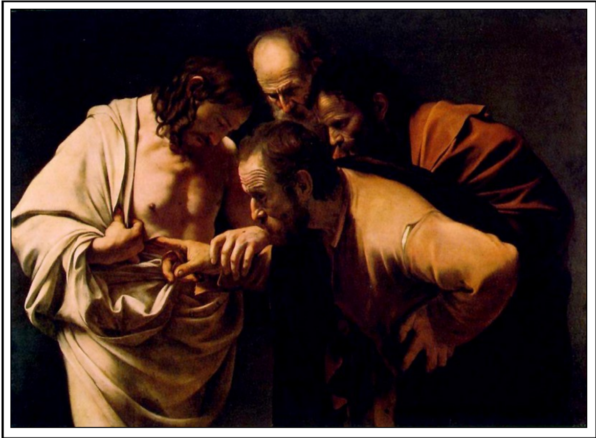
THE INCREDULITY OF SAINT THOMAS Oil painting by Michelangelo Merisi da Caravaggio ~ 1602-1602 Sanssouci Picture Gallery ~ Postdam, Germany

EXPLORING THE BEAUTY & TRADITION OF SACRED ART