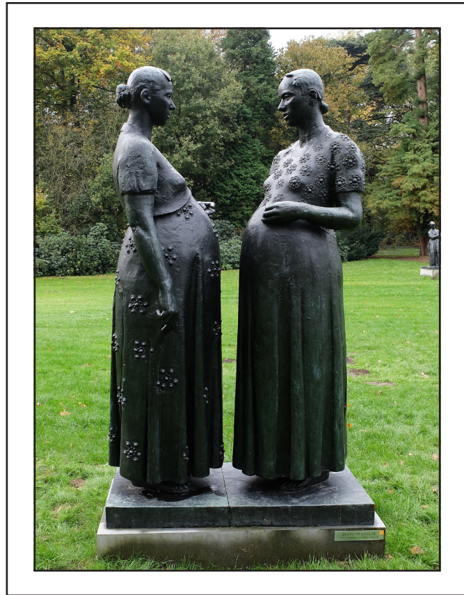
TWO PREGNANT WOMEN Metal Sculpture by Charles Leplae ~ 1953 Middelheim Museum ~ Antwerp, Belgium

CELEBRATING THE BEAUTY & TRADITION OF SACRED ART