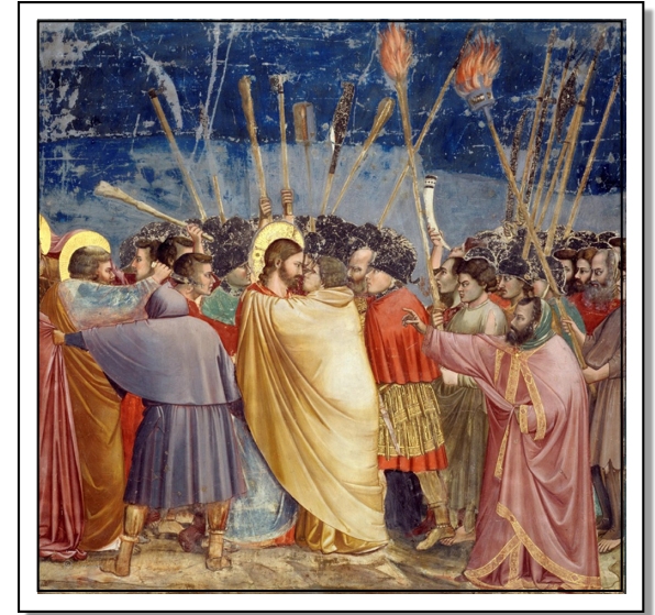
THE KISS OF JUDAS

EXPLORING THE BEAUTY & TRADITION OF SACRED ART