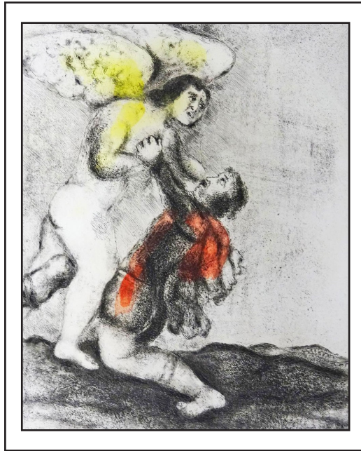
JACOB WRESTLING WITH THE ANGEL

CELEBRATING THE BEAUTY & TRADITION OF SACRED ART