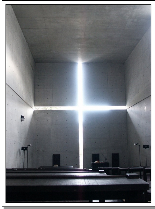
INTERIOR, CHURCH OF THE LIGHT Architecture by Tadao Ando ~ 1999 Ibaraki Kasugaoka Church ~ Ibaraki, Japan