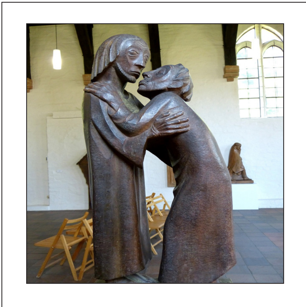
REUNION ~ THOMAS AND CHRIST Bronze sculpture by Ernst Barlach ~ 1926 St. Gertrude's Chapel ~ Gustrow, Germany