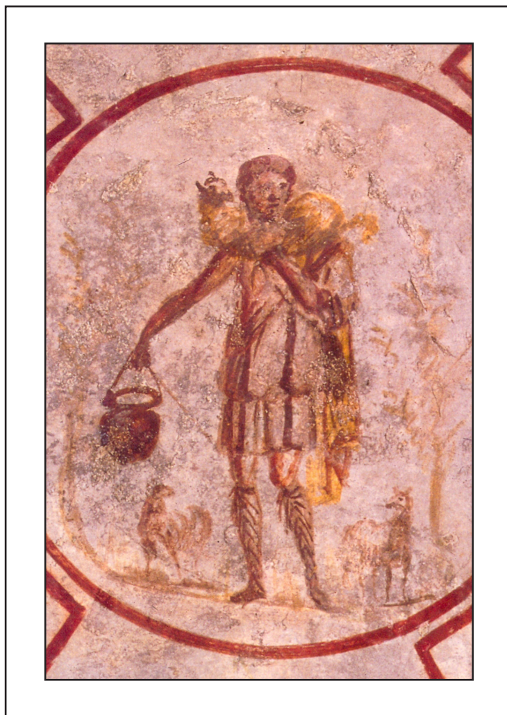
CATACOMB OF CALLIXTUS ~ THE GOOD SHEPHERD

Painting on the rock of the tombs ~ Mid 3rd Century