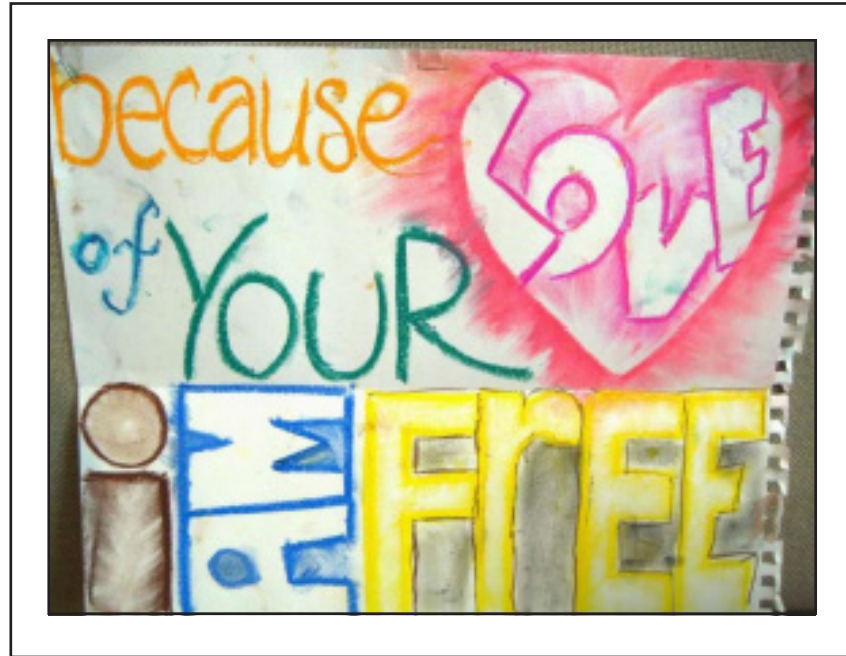
BECAUSE OF YOUR LOVE I AM FREE!

CELEBRATING THE BEAUTY & TRADITION OF SACRED ART