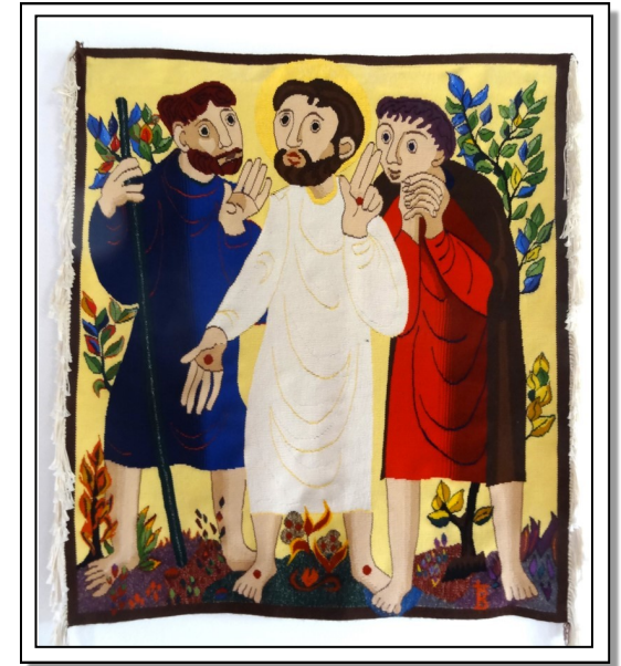
RISEN CHRIST ON THE ROAD TO EMMAUS Woven Tapestry ~ Created after 1965 Bose Monastic Community ~ Magnano, Italy

EXPLORING THE BEAUTY & TRADITION OF SACRED ART