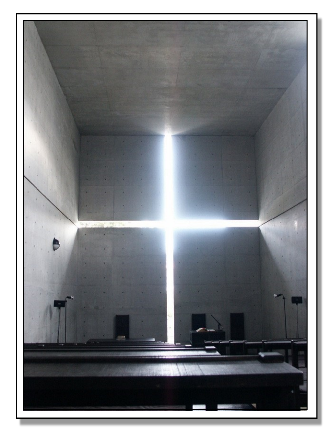
INTERIOR ~ CHURCH OF THE LIGHT Architecture by Tadao Ando ~ 1999 ~ Ibaraki Kasugaoka Church ~ Ibaraki, Japan