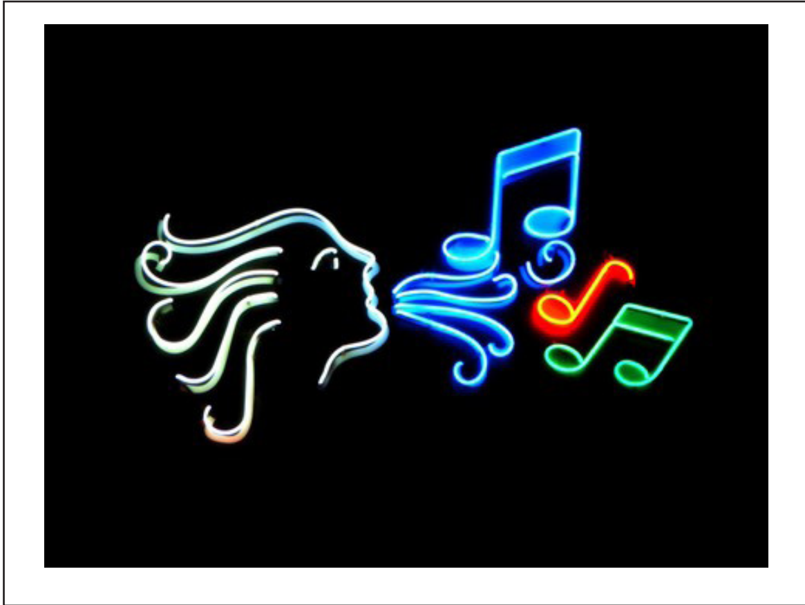
NEON MUSIC SIGN

Artist unknown