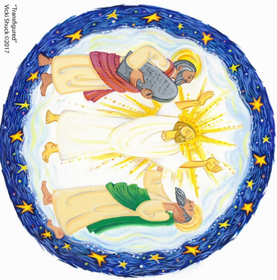
"Transfigured" Vicki Shuck ©2017