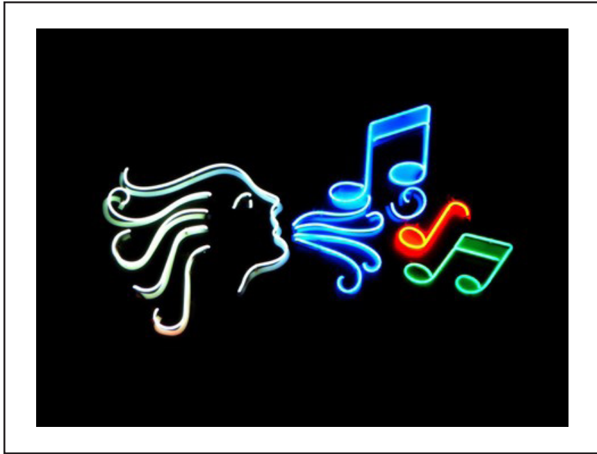
NEON MUSIC SIGN

CELEBRATING THE BEAUTY & TRADITION OF SACRED ART