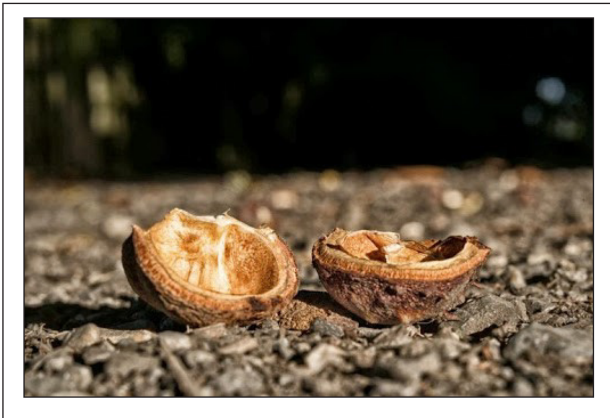
CLOSE-UP PHOTOGRAPH OF MUSTARD SEED, BROKEN OPEN